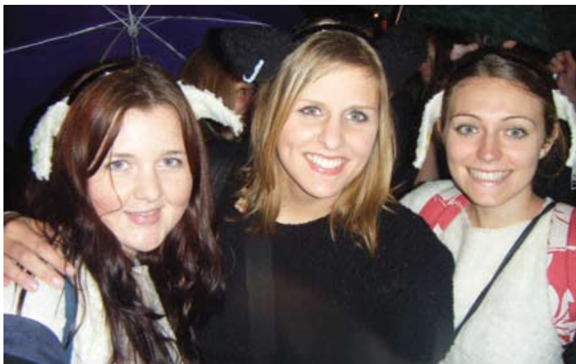
AVS 'sports' in Edinbaaaa

If you want your opinions on political, educational, welfare or financial issues to be heard, then you need to get in touch with us. You can do that in a number of different ways: via your AVS rep (look out for their details on the AVS noticeboard, they will probably be around to talk to you in the next few weeks) or via our website, www.avs-uk.org.uk where members' login allows you to access questionnaires seeking your personal opinion on current issues. You can also raise issues and seek help from fellow veterinary students on our Facebook page, and follow us on Twitter.