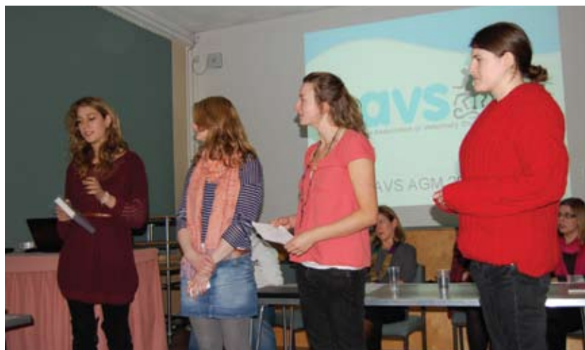
Students introduce themselves at the AVS AGM in the hopes of securing an AVS role

AVS represents almost all UK and Dublin veterinary students, and aims to improve undergraduate education through student liaison, mainly by bringing together UK veterinary students on a regular basis. We do this largely through our uni reps; each university has two AVS reps that also belong to their student Vet Soc. The reps act as a link with the other universities and are able to take any issues back to the main committee, and seek opinion from their own student body on matters that concern AVS. This is particularly important when we do the AVS survey. The AVS survey aims to identify trends in the student population, and highlight emerging or declining problems such as student debt, and funding for EMS. We use this information